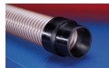
CONNECT 240 + 241 AS