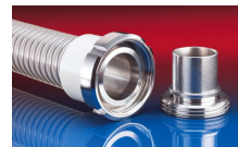
CONNECT MOULD ASSEMBLY 233