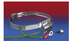
CLAMP 212 EC