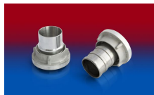
CONNECT STORZ DIN ALU 251