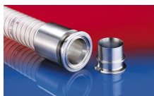
CONNECT PRESS ASSEMBLY 232