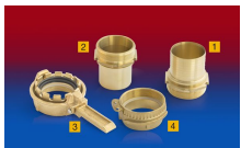
CONNECT TANK TRUCK BRASS 252