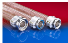
CONNECT SAFETY CLAMP ASSEMBLY 231