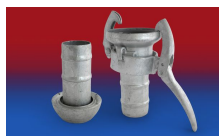
CONNECT KARDAN 254