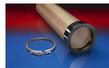
CONNECT 245 VAC-TRUCK