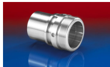
CONNECT THREAD FITTING 234