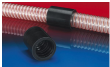
CONNECT 246 AS