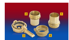
CONNECT TANK TRUCK BRASS 252