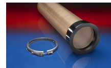
CONNECT 245 VAC-TRUCK