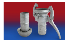
CONNECT KARDAN 254