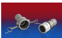
CONNECT KAMLOK ALU 253