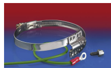
CLAMP 212 EC