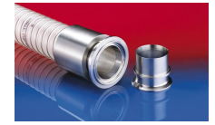
CONNECT PRESS ASSEMBLY 232