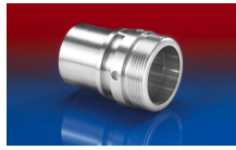
CONNECT THREAD FITTING 234