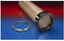
CONNECT 245 VAC-TRUCK