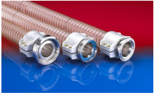
CONNECT SAFETY CLAMP ASSEMBLY 231