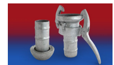
CONNECT KARDAN 254