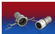
CONNECT KAMLOK ALU CLAMP 211 253