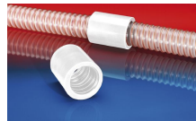
CONNECT 246 FOOD