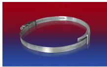
CLAMP 210 BRIDGE CLAMP