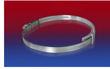
CLAMP 210 BRIDGE CLAMP