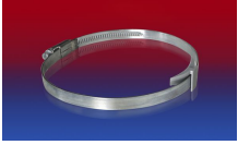
CLAMP 210 BRIDGE CLAMP