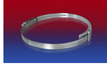
CLAMP 210 BRIDGE CLAMP